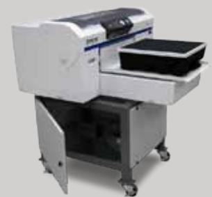
Epson SureColor F2000 DTG Printer