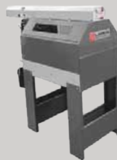
Lawson Pre-Treat Zoom XL Automatic Sprayer