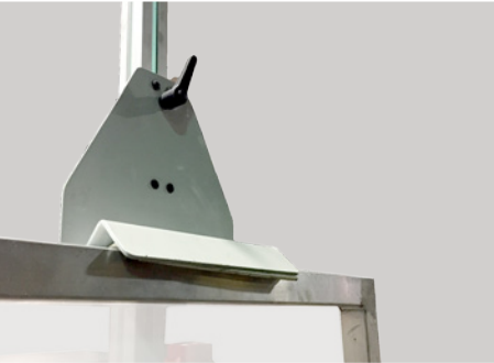
Adjustable Frame Holder