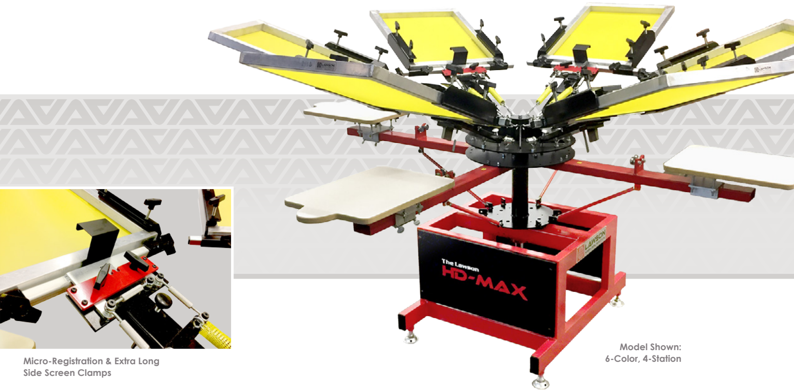
Micro-Registration & Extra Long Side Screen Clamps