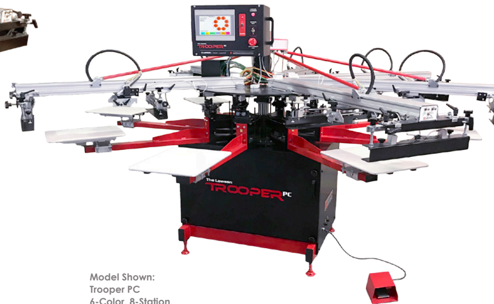
Model Shown: Trooper PC 6-Color, 8-Station, 8-Color, 10-Station (optional)

Mini-Trooper Series: 3, 4 or 5 Colors available