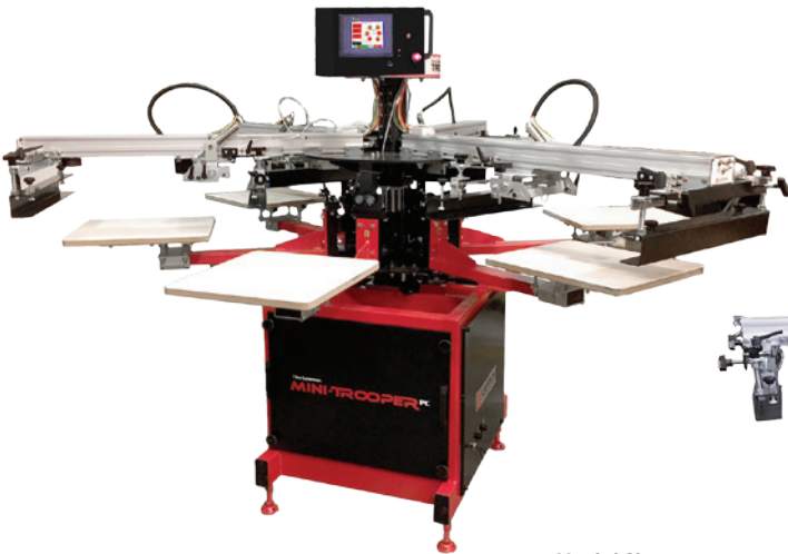
Model Shown: Mini-Trooper PC 4-Color, 6-Station

If You Need to Print More Colors, Then the Mini-Trooper and Trooper will Make a Great Addition for Your Shop.