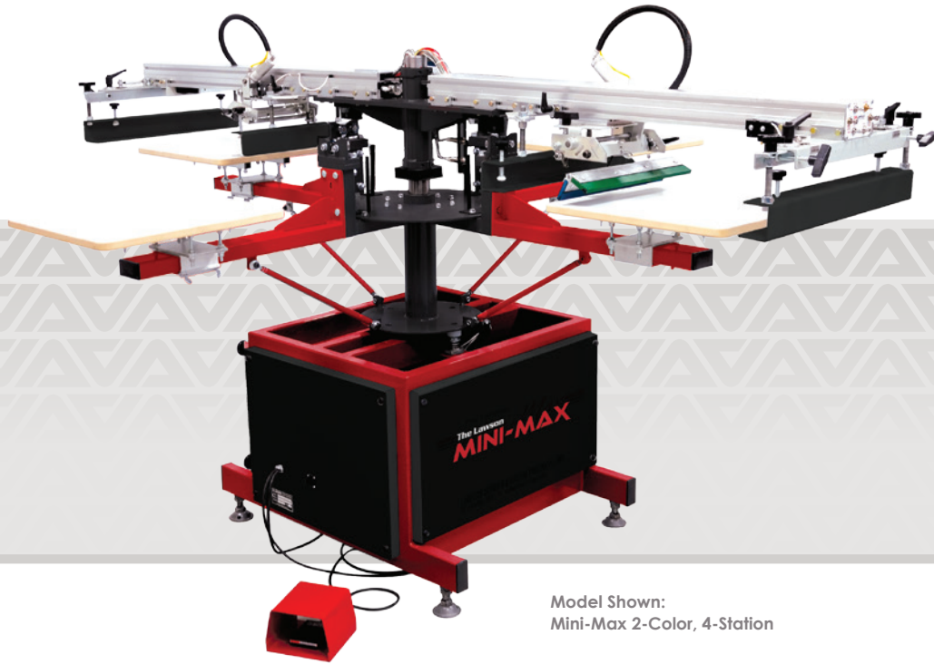
Model Shown: Mini-Max 2-Color, 4-Station