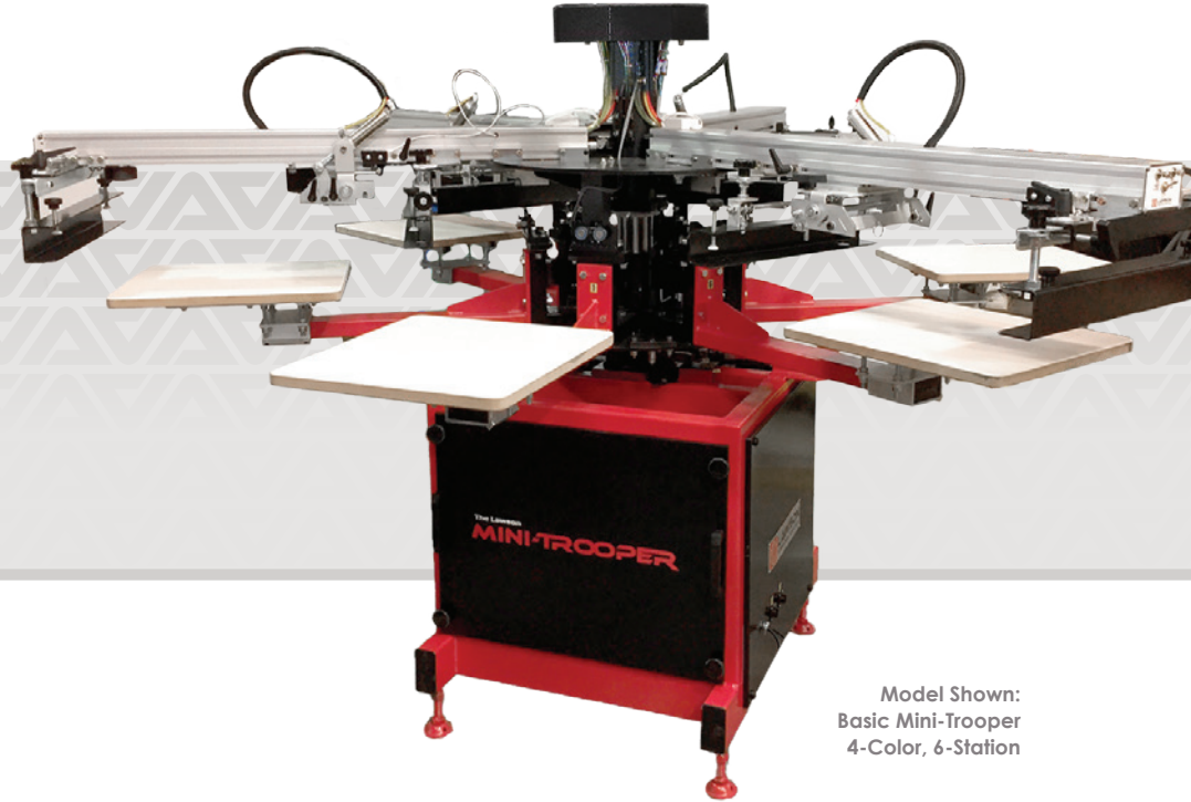
Model Shown: Basic Mini-Trooper 4-Color, 6-Station