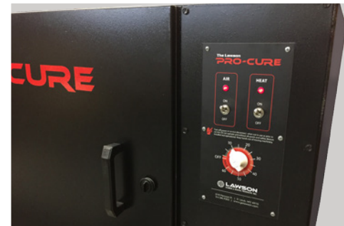
Independent Toggle Switches for Air and Heat