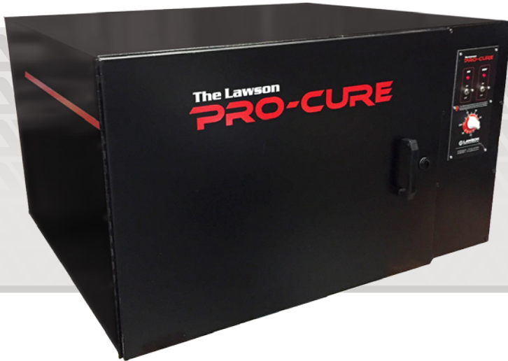
Mesh Screen Dryer System