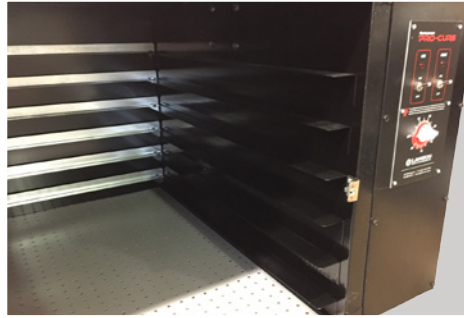
Permanent Screen Holders